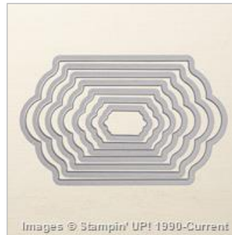
Lots Of Labels Framelits Dies