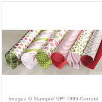
Merry Moments Designer Series