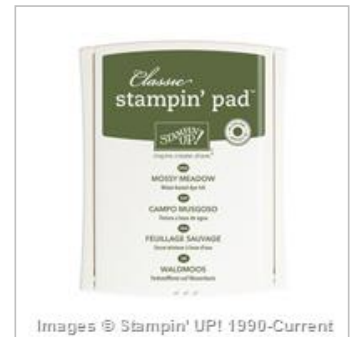
Mossy Meadow Classic Stampin' Pad