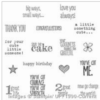
Something To Say Wood-Mount Stamp

12. Cut one star out of the Designer Series Paper and glue to the top right side of the label.