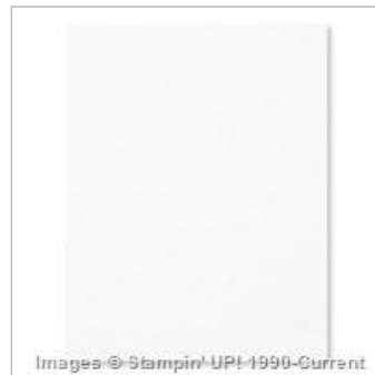
Whisper White 8-1/2" X 11" Cardstock