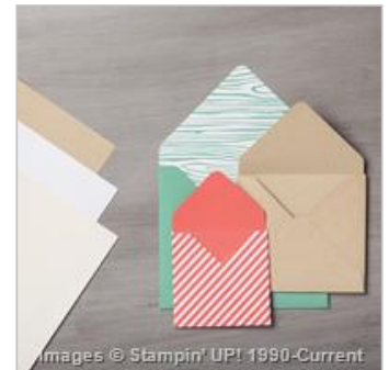
Neutrals Envelope Paper