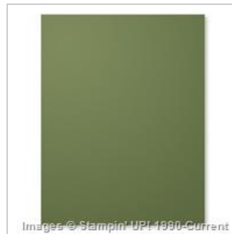
Mossy Meadow 8-1/2" X 11" Cardstock