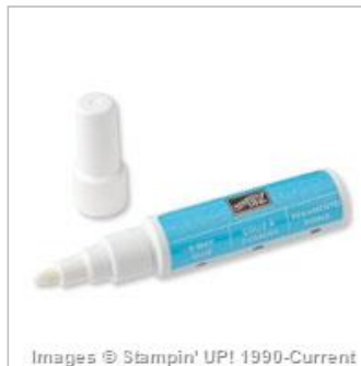
2-Way Glue Pen