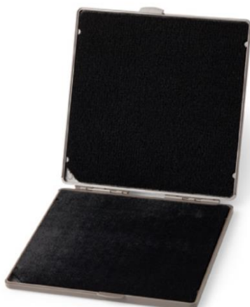
Stampin’ Scrub #126200